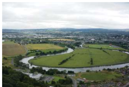
The Forth River