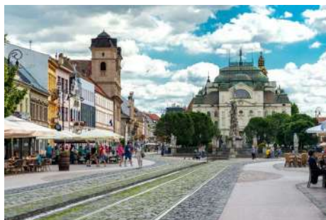
Main street of Kosice