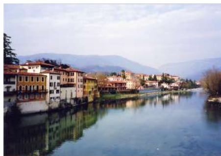
The Brenta River